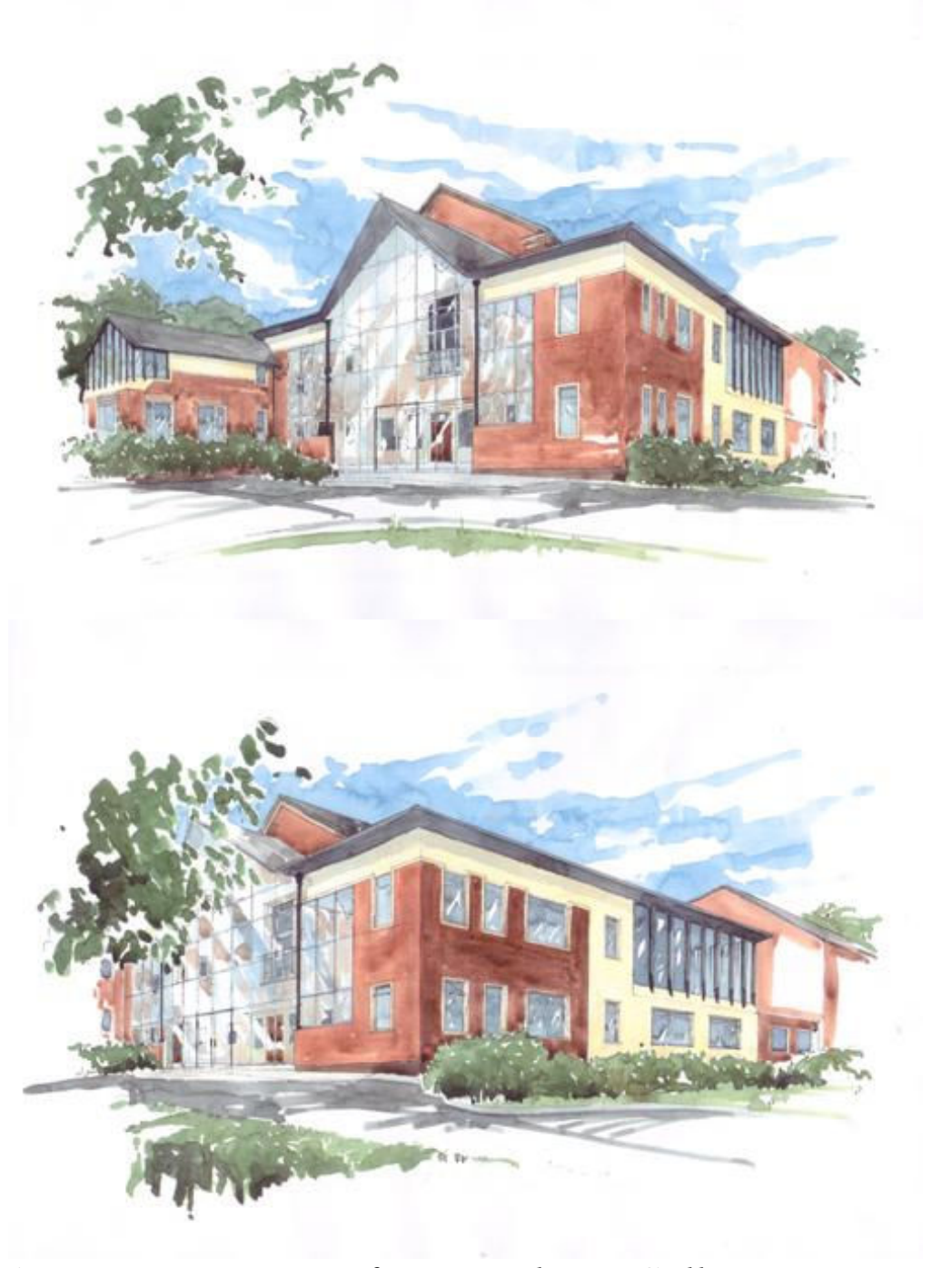
Artist's impressions of proposed new College extension